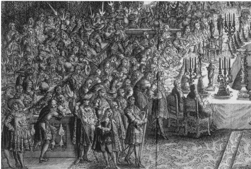
Fig. 2 Accession to power of Karl XI. of Sweden in Stockholm, 1672.

Never intended to be used as a weapon the present partizans functioned to communicate the ducal wealth, power and status. Originally there were more than 60 of these, which must have cost a fortune. Whenever there was wedding, a diplomatic event or any other occasion to celebrate a great feast these partizans formed part of the event. They can be seen as an interesting reference to 18 th century courtly culture in general, and dining culture in particular. Duke August Wilhelm was famous all over Europe for his extravagant lifestyle and the feasts he celebrated.