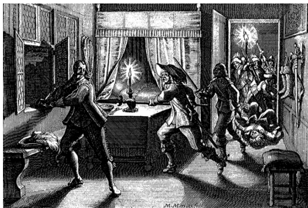
Fig. 1 Assassination of Wallenstein in 1634. ii

Like other types of arms the partizan underwent technical changes in the course of time (see the sketch of Bashford Dean in the preceding dossier). The original form that was also called oxtongue features a blade of arm length tapering evenly to an acute point with straight edges. At the base it was about a hand wide. In order to reinforce the head it was often forged with a midrib. While early examples predominately lacked parrying devices soon two hooks were molded at the base of the blade. In this way it became feasible to parry the opponent's attacks and a skilful combatant could also clamp the enemy's weapon and snatch it away. Like other polearms an advantage of it was keeping the adversary at a distance. In the course of the 16th century the parrying hooks became larger and the blade shorter. Officers now carried partizans as signs of rank.